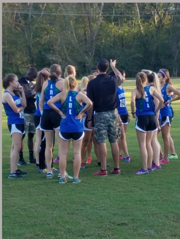
HS Cross Country

If you have pictures of our Knights athletes, please send them to mjoseph@Incharter.org and slay@Incharter.org for posting on our website and on social media.